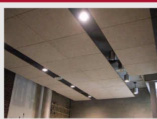
Panel and Ceiling Hanging