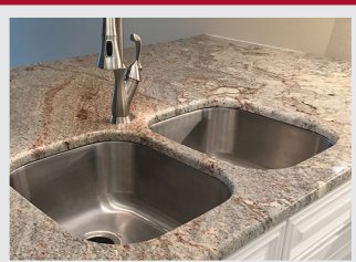
Under-mount Sink Anchor