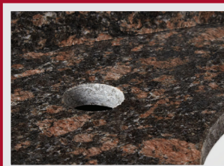
Faucet Hole Drilling