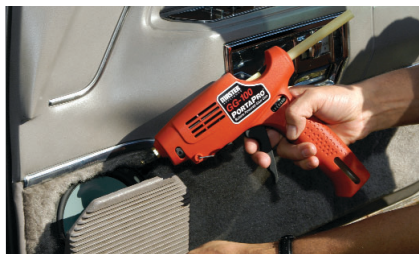
Cordless operation gives you the freedom to take the glue gun to the jobsite.