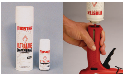
Powered by Master Ultratane butane

Boxed includes: GG-100 Glue Gun with standard general use nozzle and 4 general purpose 1/2" x 6" glue sticks.