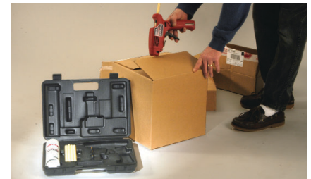
Well-suited to production applications with continuous use operating times of up to 140 min.