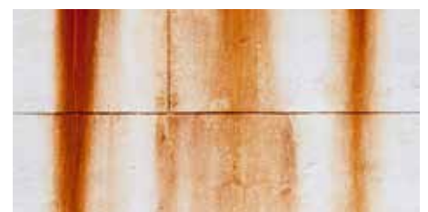
Removes rust stains