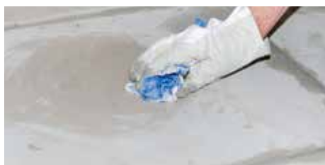
Removes grout haze