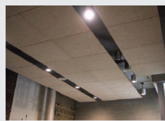
Panel and Ceiling Hanging