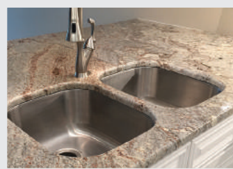
Under-mount Sink Anchor